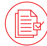
New Order Queue