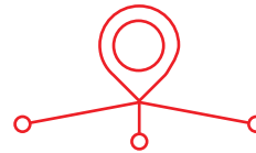
Provider Reports Distribution